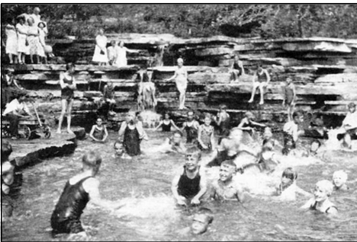
A favorite spot in the park in 1930