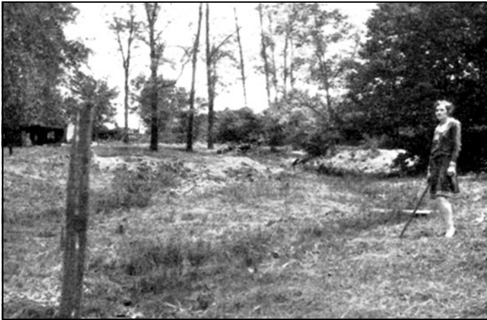
Prior to construction - 1929